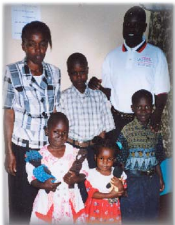
Kenya robins and their house parents