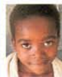
FIGURE 11 Shelton