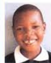
FIGURE 8 Hosea

Here are some of them. If you can help one, then we can help others!